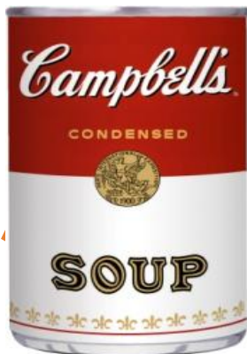
Soup for Schools